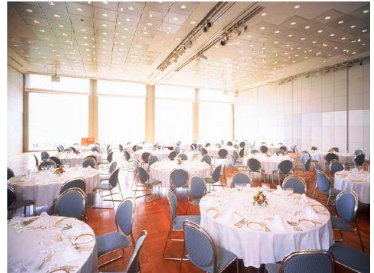
Kamakura Prince Hotel